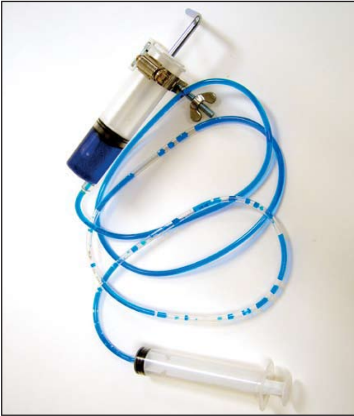
Air in Hydraulic System